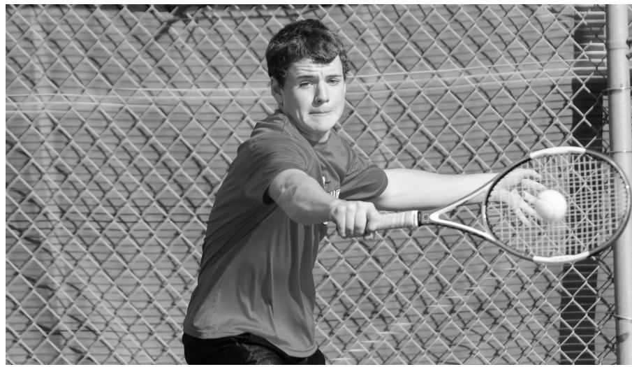
VERMILLION TANAGER