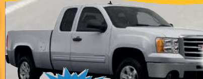
#3241 2yr/24,000 mile Maintenance Plan!

Lease for $269/mo+ OR LESS WITH QUALIFYING OFFERS $19,896.20 LEV