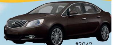
#3042 2 In Stock!