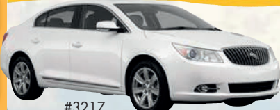
#3217 4 In Stock!