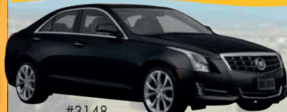
#3148 3 In Stock!