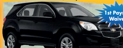
#3175 9 In Stock!