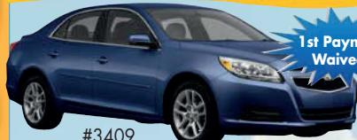
#3409 LT's & ECO's 7 In Stock!