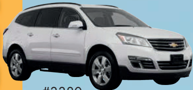
#3380 LS, 4 In Stock!