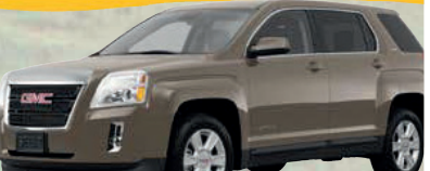
#3259 AWD SLE, 11 In Stock!

Lease for $269/mo+ OR LESS WITH QUALIFYING OFFERS $19,896.20 LEV