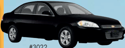
#3022 LT, Last One!