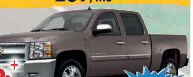
#2920 2yr/24,000 mile Maintenance Plan!

Lease for $289/mo+ OR LESS WITH QUALIFYING OFFERS $21,019.80 LEV