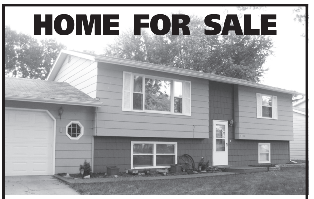
1013 Cottage Avenue • $127,900

BankWest, Inc. seeks Insurance Agents in Gregory, Mitchell and Pierre, SD. View job information and apply at www.bankwest-sd.com or call BankWest HR at 1-800-253-0362. Successful applicant must pass background screening including credit and criminal history. EO/AA Employer.