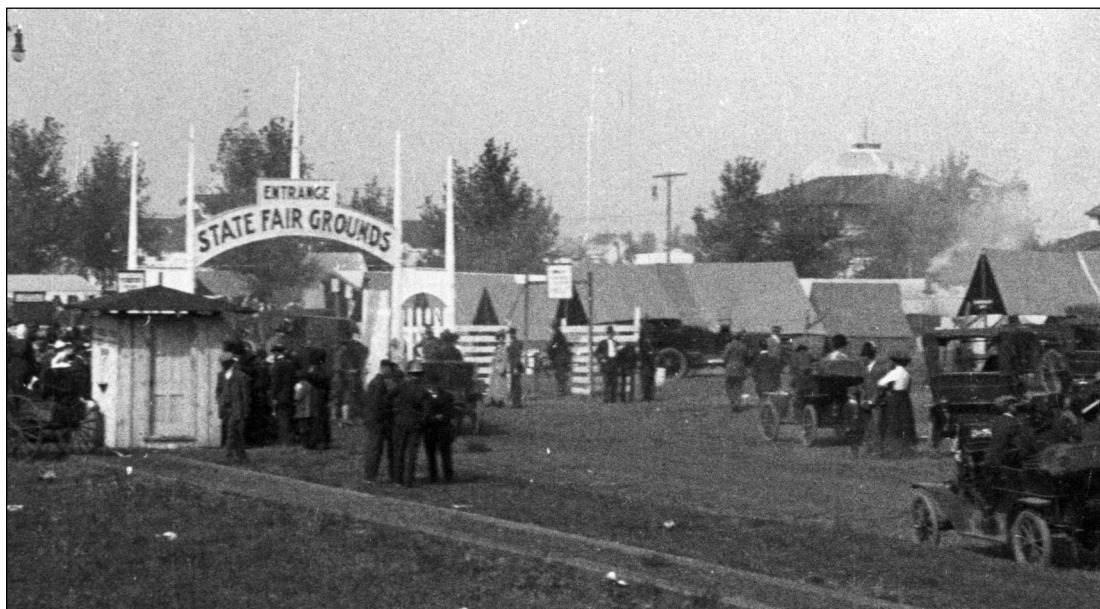
This photograph of the State Fair Grounds entrance is taken from a still of the 1912 South Dakota State Fair film, available for viewing on the South Dakota Digital Archives.