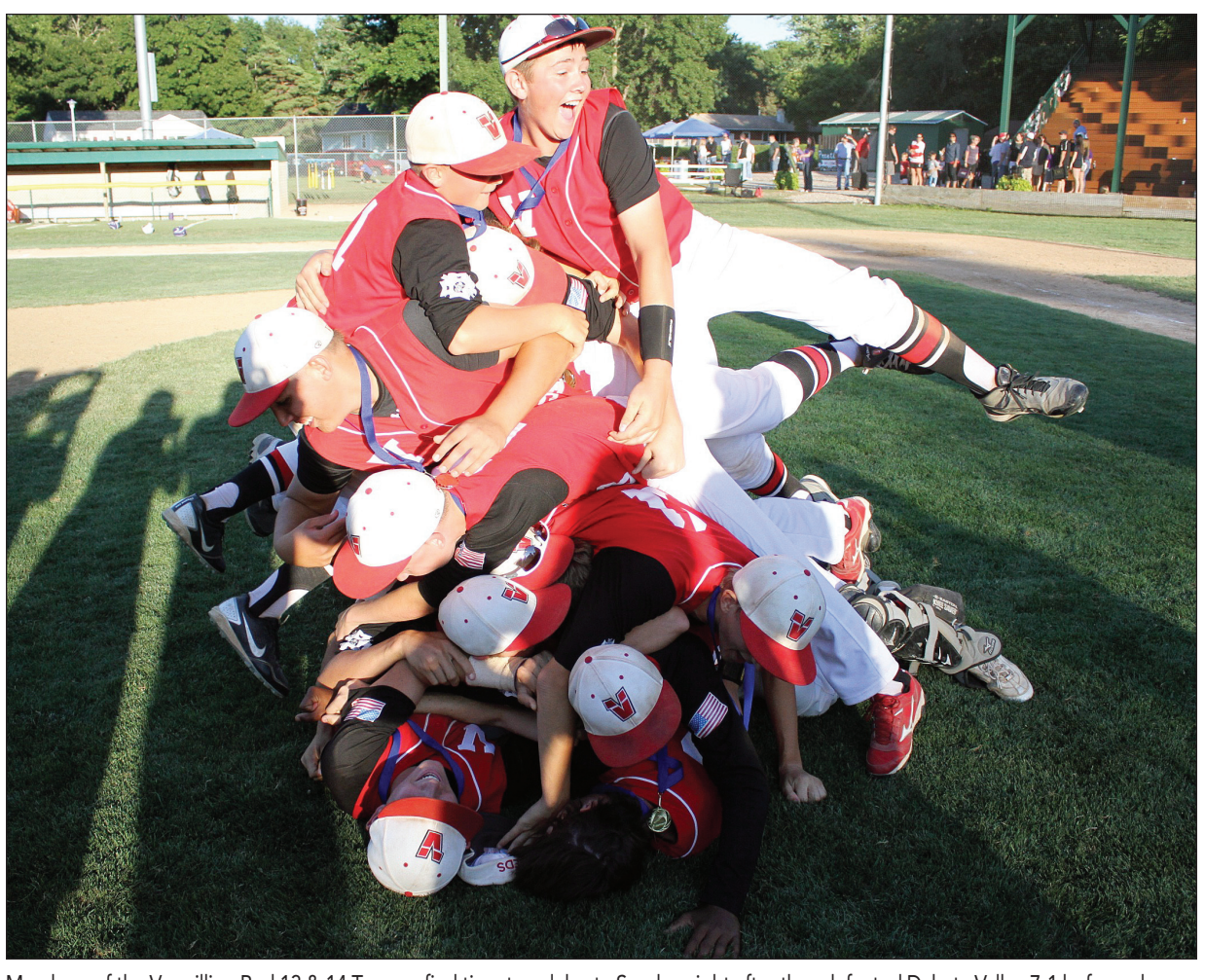
Members of the Vermillion Red 13 & 14 Teeners find time to celebrate Sunday night after they defeated Dakota Valley 7-1 before a hometown crowd at Prentis Park in Vermillion to claim the 2013 Class A VFW South Dakota Teener Championship. To see or purchase images from this event, visit spotted.plaintalk.net.