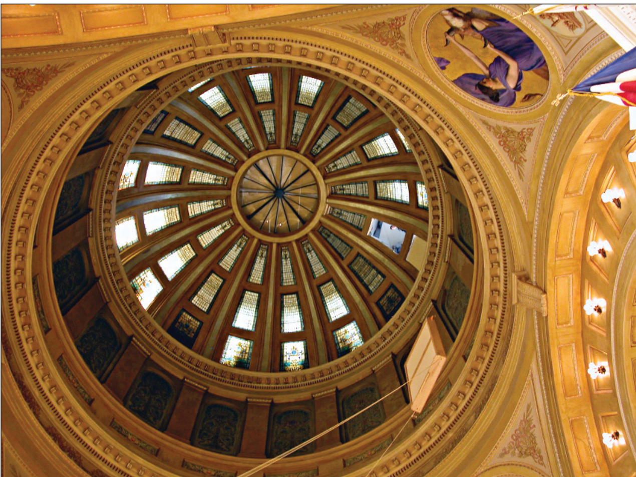
Workers began removing panels of stained glass from the Capitol rotunda Monday as part of a 14-month, $2.7 million project that will also remove, clean and renovate the stained glass in the roofs of the House and Senate chambers and the third-floor barrel over the grand staircase.

Fry said a replacement plan for worn carpet in the House and Senate chambers will be put on hold until