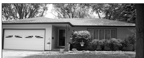
524 Catalina • $155,800 Hosted by Crystal McGuire