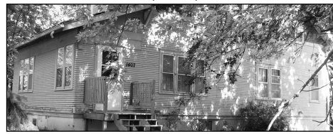
1407 E. Main • $129,500 Hosted by Melvin Walz