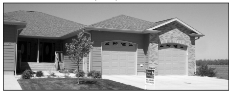
23 Cypress • $219,900 Hosted by Melvin Walz