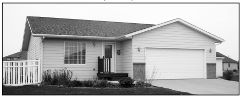
415 Pinehurst • $199,900 Hosted by Hazen Bye