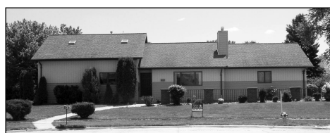
508 Crawford Ct. • $249,950 Hosted by Rusty Jensen