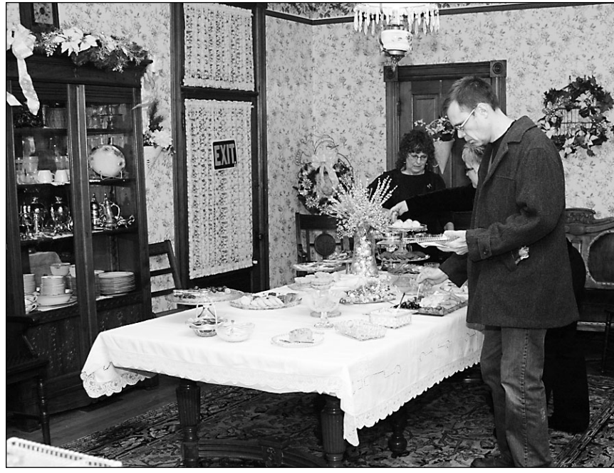
The theme of this year's Tour of Homes sponsored by the Clay County Historical Society, on Saturday, Dec. 3 was "I'm Dreaming of a White Christmas," and that's just what the planners received when it began snowing heavily just before the tour was to begin. That didn't keep people from participating, however, or from enjoying something to eat at a reception afterwards at the Austin Whittemore House.