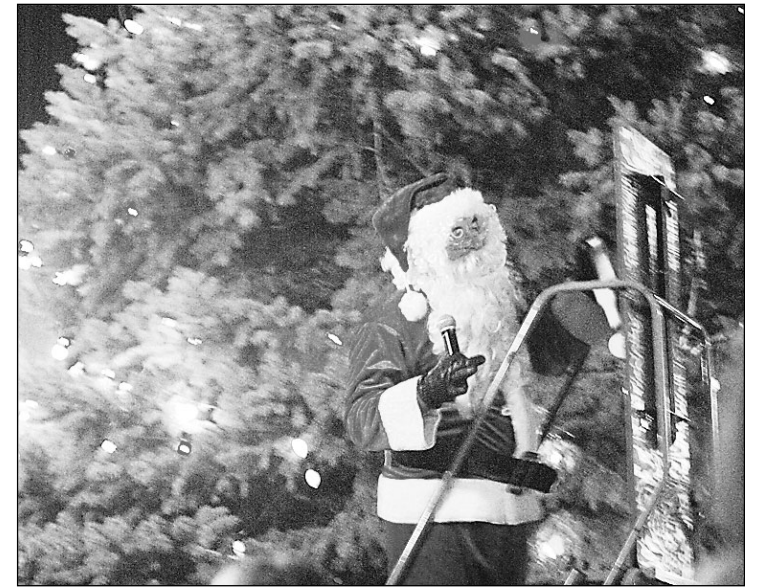
Santa flips the switch to light the Community Christmas Tree at Ratingen Platz in downtown Vermillion Friday night, Dec. 2, following the third Annual Parade of Lights. Following the parade, children and parents were invited to the Vermillion Public Library for "Stockings for Soldiers," an opportunity to make an ornament to take home and to decorate a stocking for a soldier serving overseas.