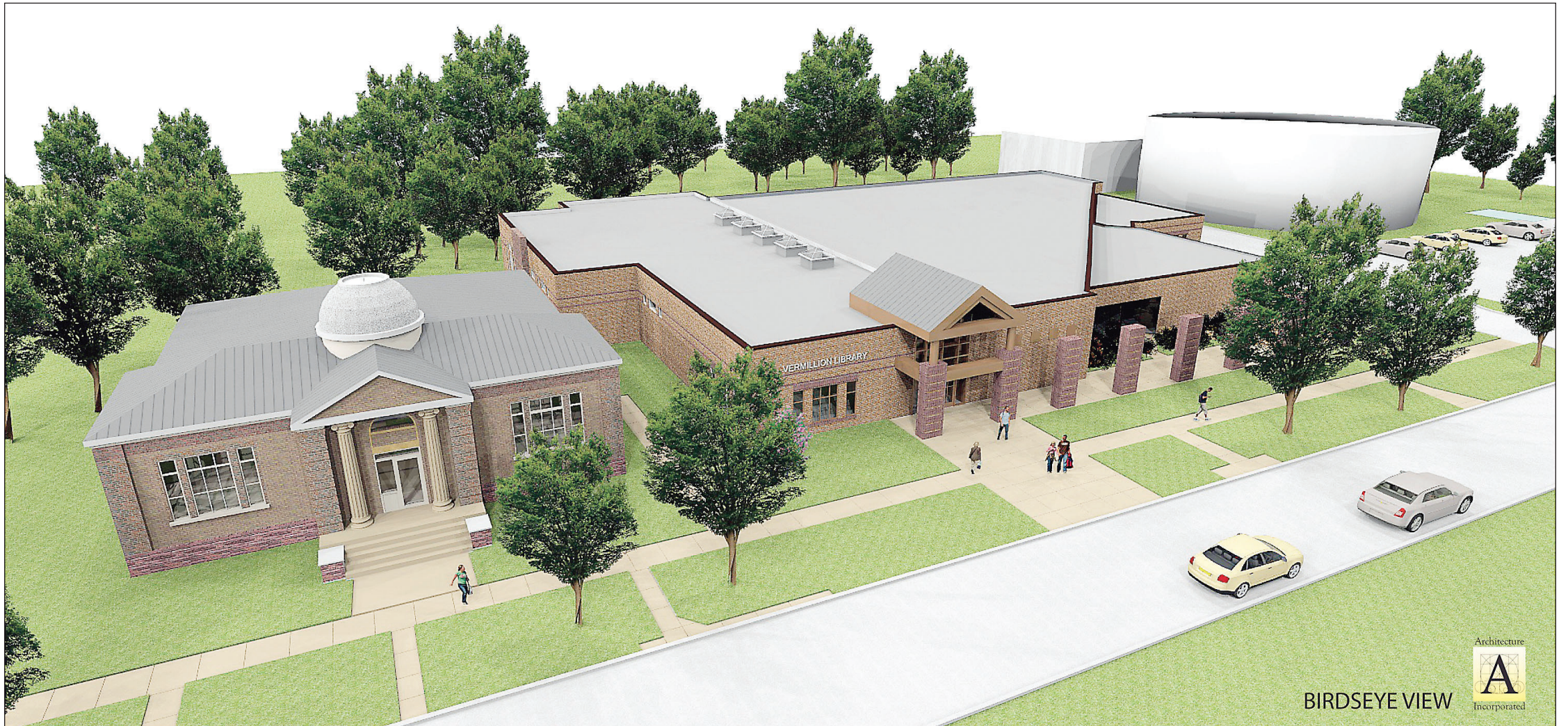
This architect's rendering shows a bird's-eye view of the outer appearance of the Vermillion City Library after its expansion is complete. The addition has been designed to complement the existing Carnegie Library building located next door to the north. "The design incorporates a gable-roofed entry off of the west. We're looking at matching the brick, which is an orange-colored blend which we see around the library, and then accenting that with some quartzite colors, again of brick, but which relate to the historic nature of the Carnegie Library," said Liz Squyer, principal architect with Architecture Incorporated of Sioux Falls.