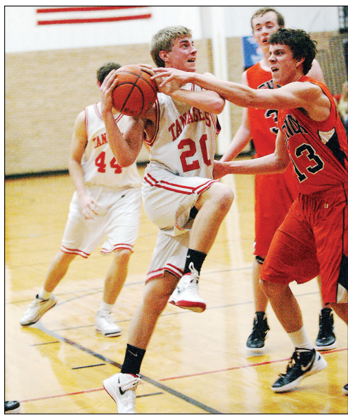
Tanagers remain undefeated