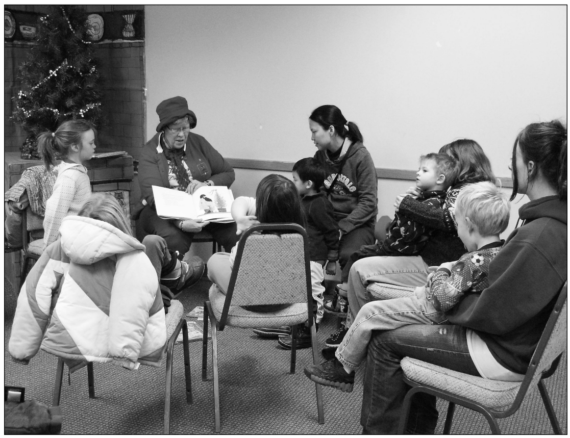
Ms. Santa visited the Vermillion Public Library Dec. 10 to read stories to local children. Her appearance was made possible by Yankton Area Literacy Council, which also gave out story books to the children.