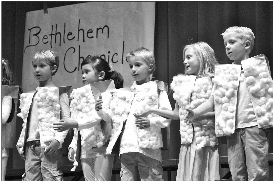
Students from St. Agnes School perform "The Christmas Chronicles" Wednesday night in the school auditorium.