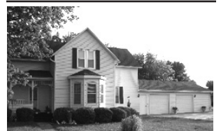
204 Brown St., Gayville For Sale by Owner $137,000

4-Bedroom, 2-full bath, 1881 square feet, 2+ car garage. (605)660-7537 www.yankton.net/app/html/204brown/