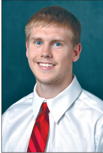
Men's Basketball Jersey #: 14 Position: Guard Height: 6-1 From: Carroll, Iowa