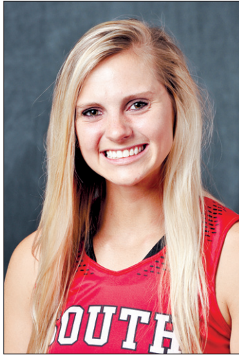
Women's Basketball Jersey #: 42 Position: Guard Height: 5-10 From: Brandon, South Dakota