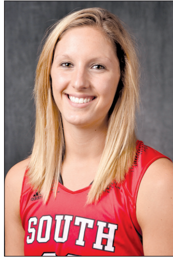
Women's Basketball Jersey #: 30 Position: Center Height: 6-2 From: Rapid City, South Dakota