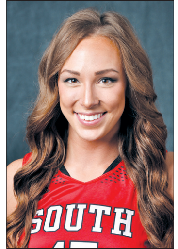
Women's Basketball Jersey #: 15 Position: Guard Height: 6-0 From: Amery, Wisconsin