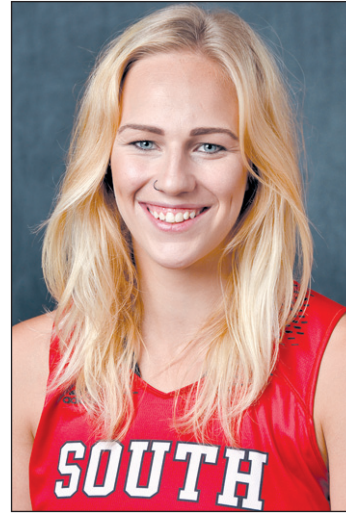
Women's Basketball Jersey #: 35 Position: Guard Height: 5-10 From: Renmark, South Australia