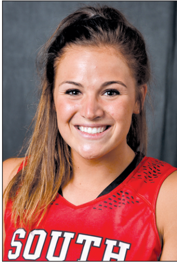
Women's Basketball Jersey #: 4 Position: Guard Height: 5-8 From: Watertown, South Dakota