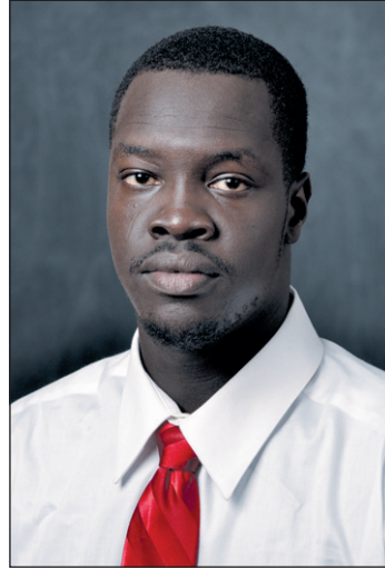
Men's Basketball Jersey #: 24 Position: Forward Height: 6-5 From: Omaha, Nebraska