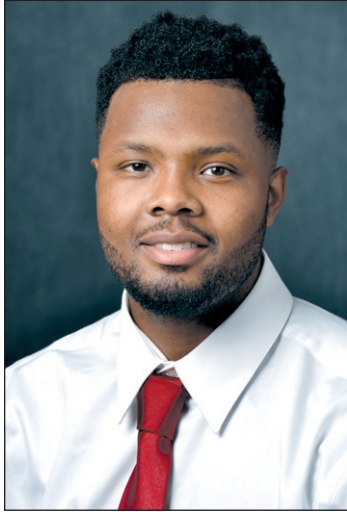
Men's Basketball Jersey #: 1 Position: Guard Height: 6-5 From: Madison, Wisconsin