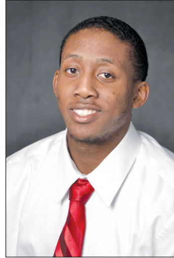
Men's Basketball Jersey #: 1 Position: Guard Height: 6-0 From: Grand Prairie, Texas