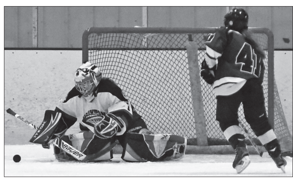
Yankton's Renee Cross (left)