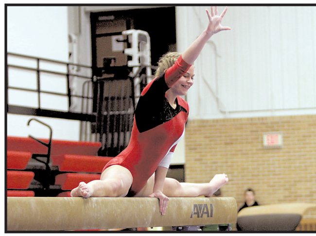
Tanager Gymnasts Reach For The Top PAGE 6