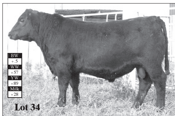
Lot 34 Koupal Juneau 9127 16416173 • Birth 70lbs • 205 adj. 777 • 365 adj. 1281