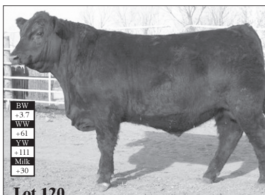
Lot 120 Koupal B & B Predestined 9046 16419324 • Birth 82 • 205 adj. 802 • 365 adj. 1421