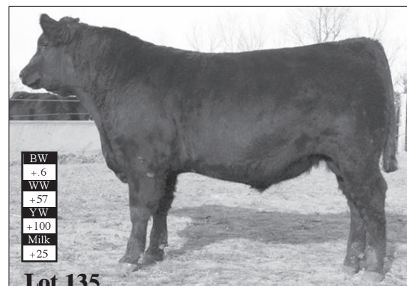
Lot 135 Koupal B & B Bismark 904 16456020 • Birth 77 • 205 adj. 752 • 365 adj. 1382