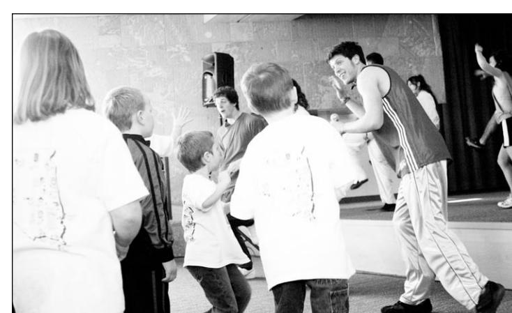
Kindergarten students from St. Agnes School in Vermillion learned a few new dance moves, thanks to a quick lesson provided Tuesday afternoon at the Muenster University Center on the USD campus by members of the Up With People cast.