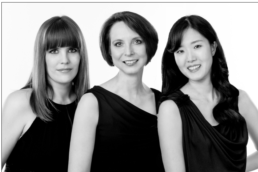
The Rawlins Piano Trio and friends will present a chamber music concert at 7:30 p.m. tonight in the National Music Museum Arne B. Larson Hall.