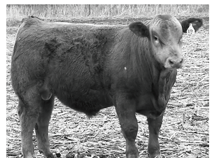
Lot 19 • PB Simmental Adj. WW 709 • No Creep • Adj. YL 1417 Sire: GLS/GF Brigade U44

Creighton Livestock Market • Creighton, Nebraska