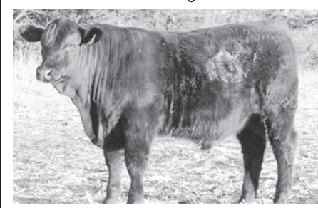
Lot 22 • 1/2 Simm, 1/2 Ang • Homo Black Adj. WW 721 • No Creep • Adj. YL 1489 Sire: Sandy Acres Juneau 43U