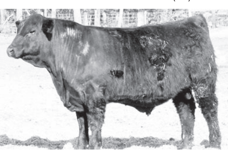
Lot 39 • Purebred • ET • Polled Adj. WW 709 • REA 14.6 CNS Dream On L186 x ES N4-donor