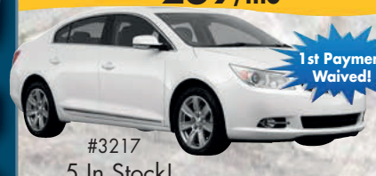
#3217 5 In Stock!