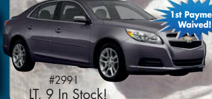
#2991 LT, 9 In Stock!