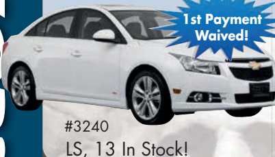
#3240 LS, 13 In Stock!