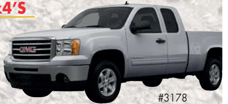
#3178 Z71 SLE, Over 20 Sierra's In Stock!

Lease for $259/mo. + or less with qualifying offers 20,153.23 LEV