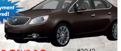
#3042 2 In Stock!