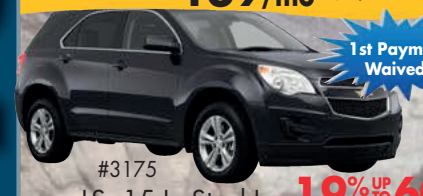
#3175 LS, 15 In Stock!