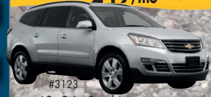
#3123 LS, 3 In Stock!