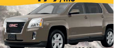
#3060 SLE, 10 In Stock!