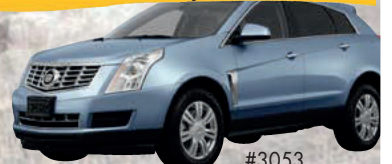
#3053 AWD, 8 In Stock!