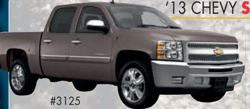
#3125 Z71 LT, Over 30 Silverado's In Stock!

Lease for $289/mo. + or less with qualifying offers 21,215.90 LEV