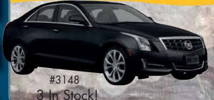
#3148 3 In Stock!