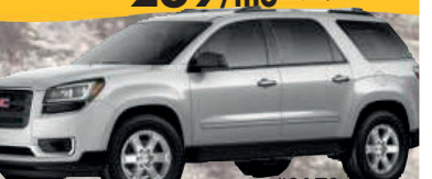
#3173 SLE, 7 In Stock!