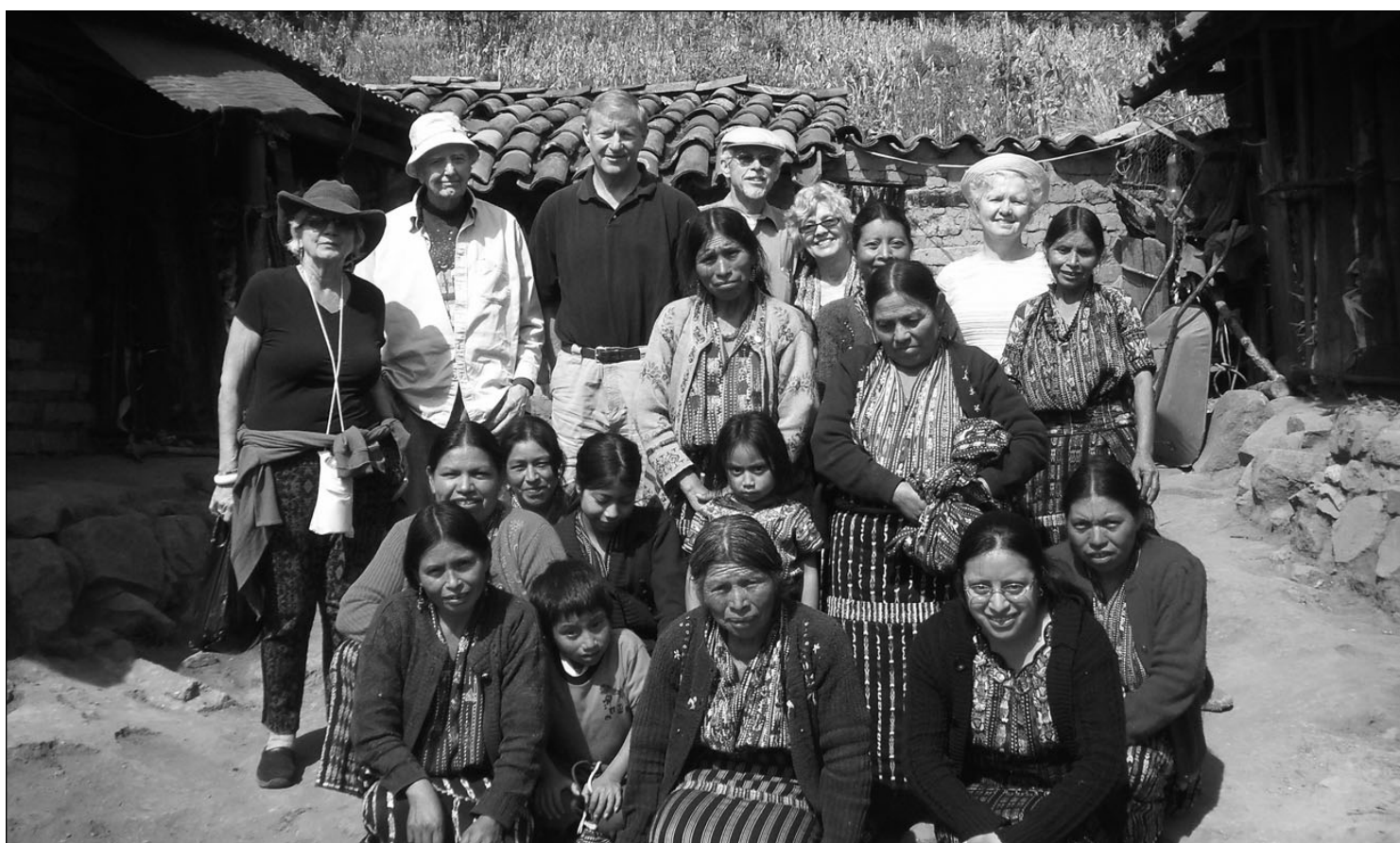
Sharing the Dream travelers visit La Estrella weavers in Chuacruz.