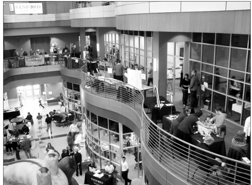
A bird's eye view of the annual Community Health & Wellness Fair, which was held Saturday in the Lee Medicine Building on the USD campus.