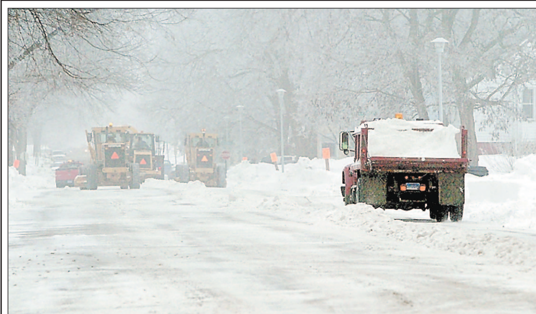
Vermillion street crews, perhaps sensing that additional bad weather could be on its way, were busy Monday taking extra steps to remove snow that had accumulated on some of Vermillion's busier streets.