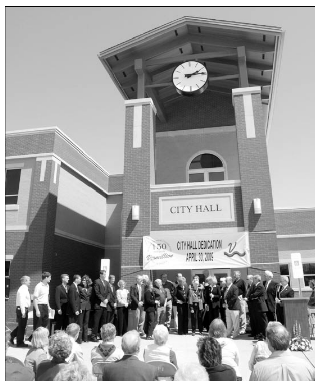
new City Hall.