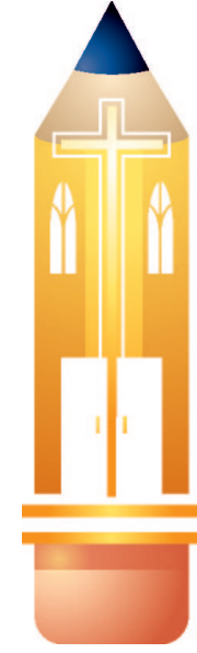
The Holy Trinity Students will be involved in many activities this week. The proceeds from the raffle and the bake sale will be used to purchase items for the Senior Citizen Center in town. The food items from the contest between grades will be delivered to the Food Pantry in Hartington. Thank you for all your help and support to help make this a successful Catholic Schools Week Celebration! God Bless You!