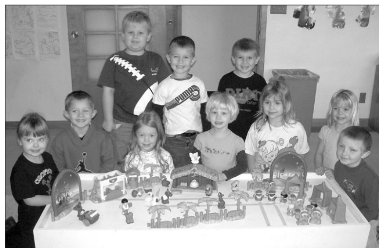
One of the preschool classes around the recently donated Nativity set.

We appreciate the time and efforts of our regular faculty who continue to sacrifice the larger salaries they could earn in the public school for the sake of the Catholic values they hold and share with their students. They are the role models for our students in the classroom and out of the classroom. Their classroom leadership and temperament helps mold the minds and decisions of our students for the future.