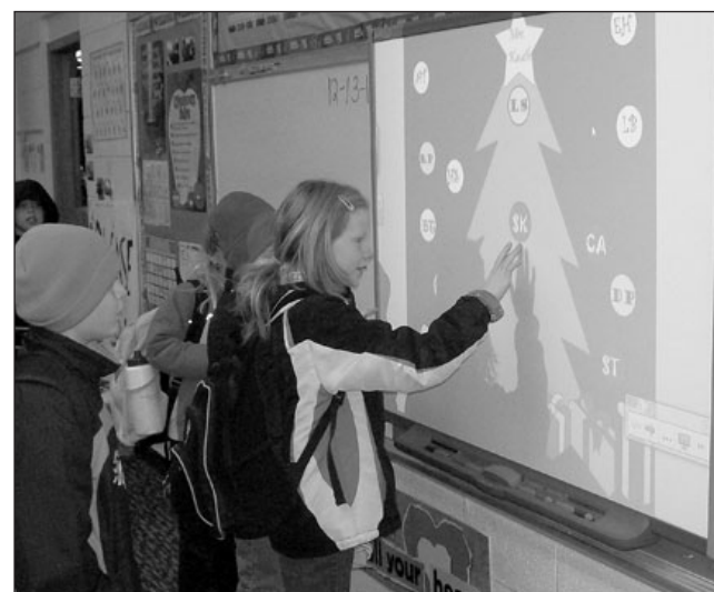
Students using the newly installed SMART Boards to take daily attendance.