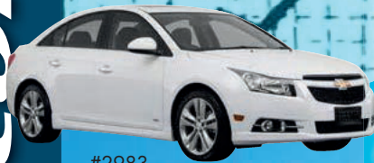
#2983 LS, 9 In Stock!