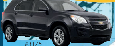
#3175 LS, 16 In Stock!