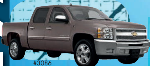
#3086 Z71 LT, Over 20 Silverado's In Stock!

Lease for $279/mo. + or less with qualifying offers 20,688.55 LEV