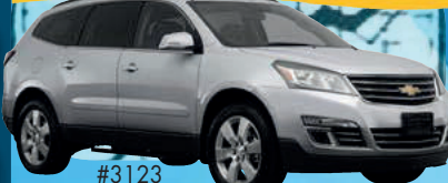
#3123 LS, 7 In Stock!