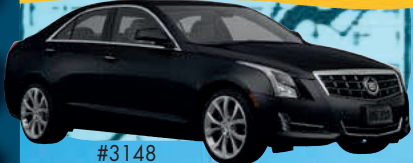
#3148 3 In Stock!