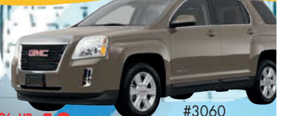
0% UP TO 48 mos. WAC #3060 SLE, 6 In Stock!