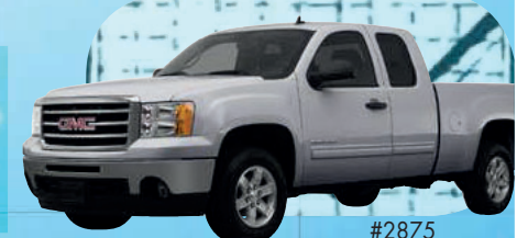
#2875 Z71 SLE, Over 20 Sierra's In Stock!