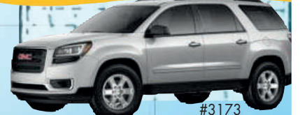
#3173 SLE, 5 In Stock!