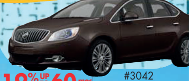
1.9% UP TO 60 mos. WAC #3042 3 In Stock!