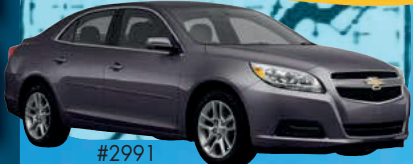
#2991 LT, 9 In Stock!