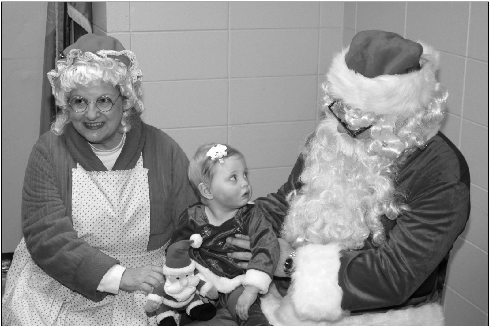
Vermillion residents braved the cold for the fourth annual Parade of Lights, which traveled down Main Street past Ratingen Platz on Dec. 7. More than a dozen floats were featured in the parade, the theme of which was "The Spirit of Christmas." The parade concluded with the arrival of Santa and Mrs. Claus and the lighting of the Community Christmas Tree. Following the parade, Mr. and Mrs. Claus met with their young admirers in the basement of the Clay County Courthouse.

The man apparently died of a self-inflicted gunshot after keeping local law enforcement at bay for approximately 12 hours.