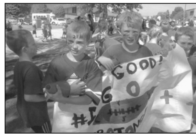
4th Graders participating in the CCHS Homecoming Parade