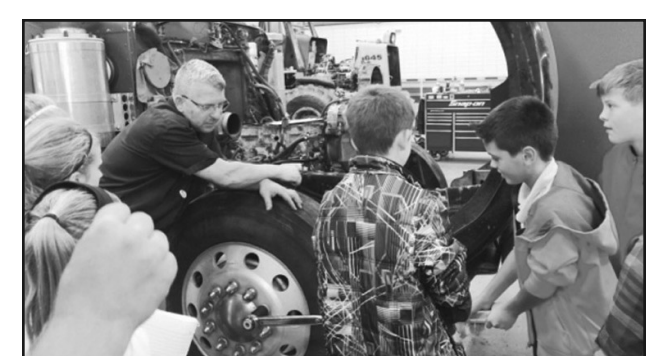
5th Grade took a Business Trip to Folkers Bros Garage