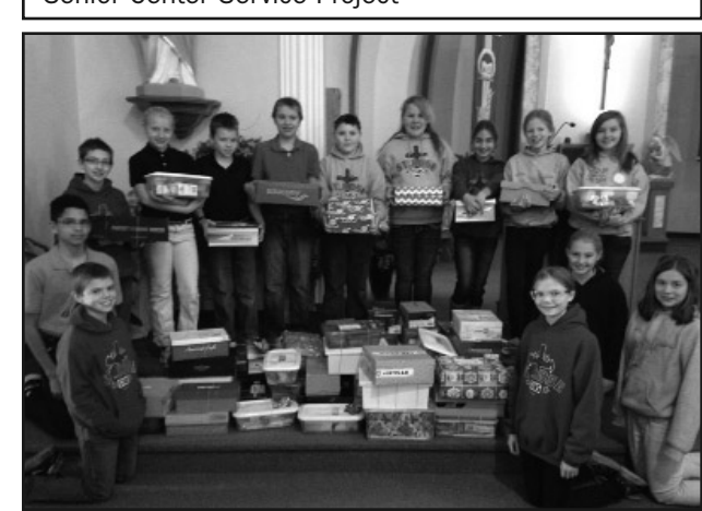
Operation Christmas Child

Alumni Mass Senior Center Service Project