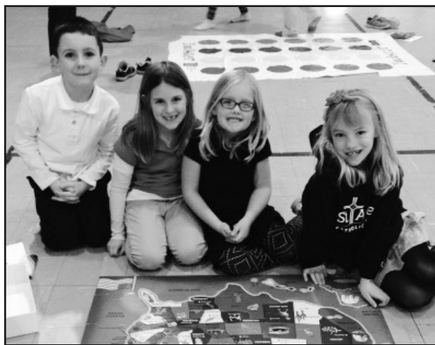
These 1st grade students were excited to complete this puzzle after spending many indoor recesses working on it!