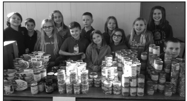
The 4th grade students provided service for the Vermillion Backpack program.