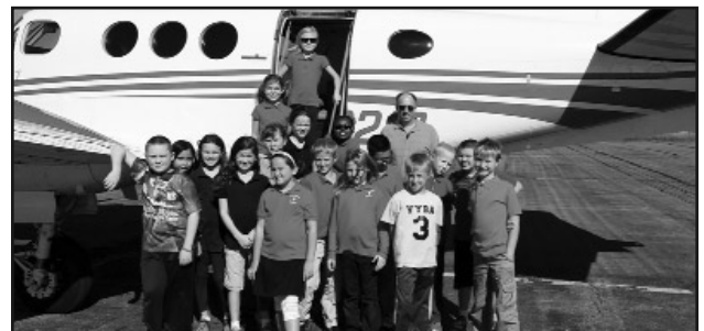
The 3rd Graders visited the Vermillion Airport as part of their Community Survey Project.