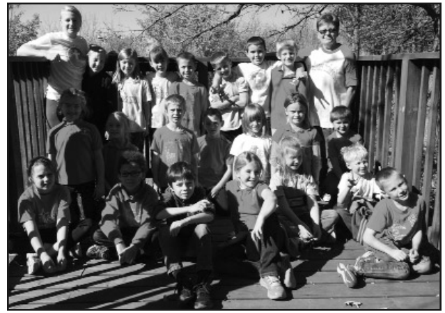
The Second Grade class enjoyed their trip to the Dorothy Pecaut Nature Center in Sioux City.