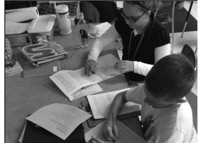
These 5th grade students are hard at work editing articles for their newspaper.