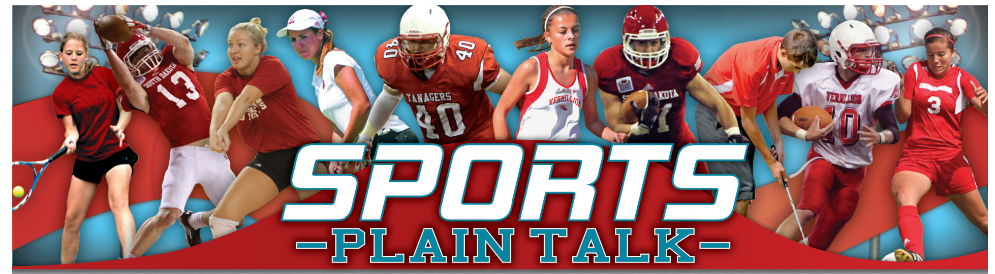
January 30, 2015 www.plaintalk.net