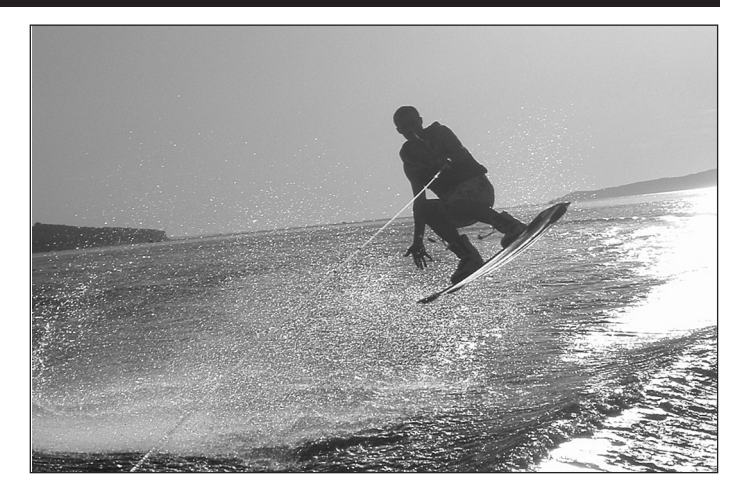
WAKEBOARDING ON LEWIS & CLARK LAKE