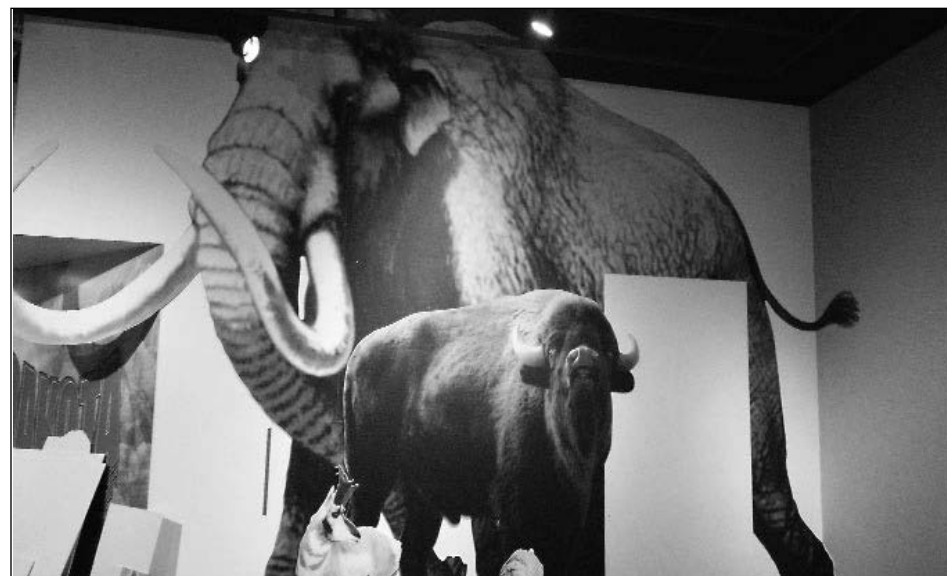
A full-size mammoth, bison, antelope, coyote and prairie dog allow visitors to see how they "measure up" in the Our South Dakota exhibit.