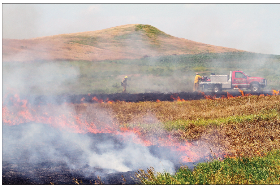
Members of the Vermillion Fire Department endure hot weather conditions as they kept watch over a controlled burn of vegetation at Spirit Mound July 8.