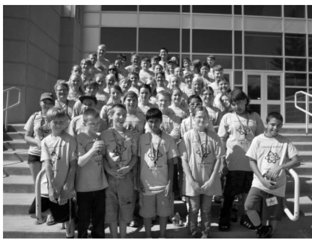
The attendees, counselors and coordinator of the 2013 Lawrence Brothers Science Camp.

"It was a lot of fun," she said. "We learned a lot of