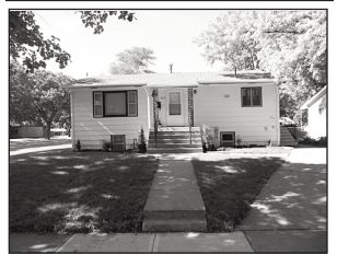
121/123 West Clark Street $125,500, Duplex

3-Bedrooms upstairs, 2-Bedrooms downstairs, Newly remodeled, Call or text (605)660-4171.