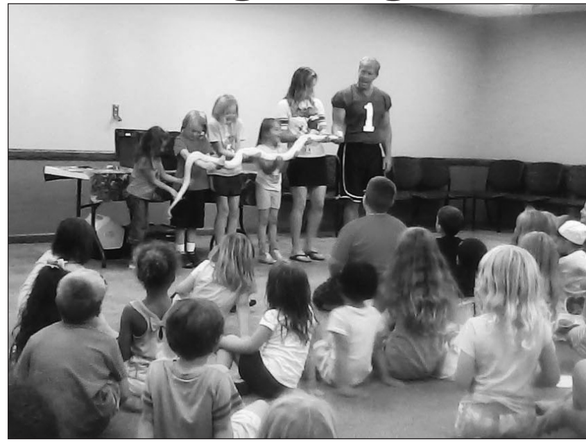
The Zoo Man and his cold-blooded friends said hello to a crowd of kids at the Vermillion public library Monday. Kids even got a chance to pet the scaly guests.

"Feels just like your mom's legs," he joked as he brought the Bearded