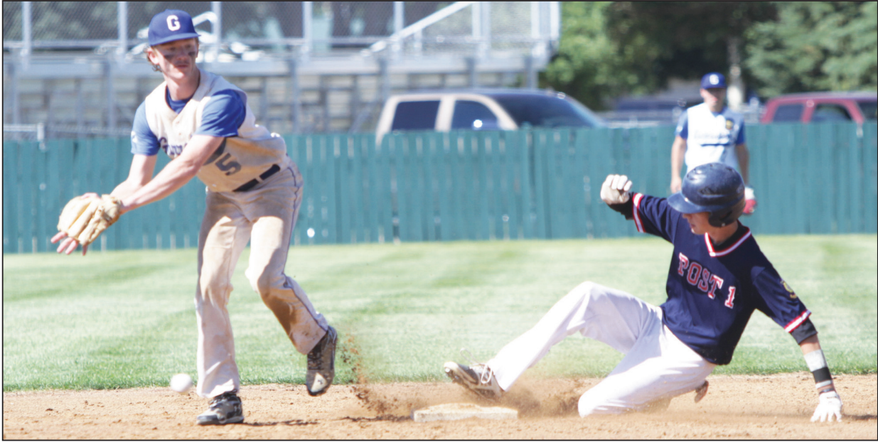
ELYSE BRIGHTMAN/ FOR THE PLAIN TALK

Place your ad by calling the Broadcaster/Plain Talk office at 605-624-4429 or by stopping in at 201 W. Cherry Street today!