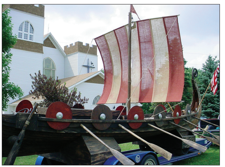
The colorful Viking ship from Wausa, NE, will be on display.

The Sioux Valley Singers, a Norwegian singing society founded in 1913, will start off the 7 p.m. program on the north lawn of the church. The Singers includes four area choruses including the Grieg Male Chorus, Canton; the Nordic Male Chorus, Sioux City; the Norse Glee Club, Sioux Falls; and the Minnehaha Mandskor, Sioux