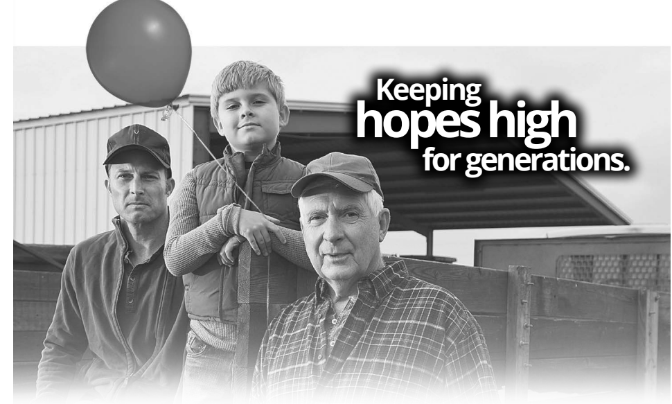
CorTrust Bank has the loans and services to help your ag business grow. Visit us today.

SELL YOUR EQUIPMENT ON BIGIRON.COM Call Today! 1-800-937-3558