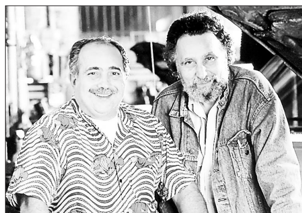
Click & Clack

warm air, and that means you can put more air into the cylinders when it's cold. But I don't think the difference is detectable by the average driver. RAY: Right. Turbochargers give you more power using a similar approach. They compress the air, and force a lot more of it into the cylinders. That allows you to burn more gasoline, and the result is more power. But that takes a tremendous amount of external pressure. It's not something you can duplicate just by lowering the temperature, even to the