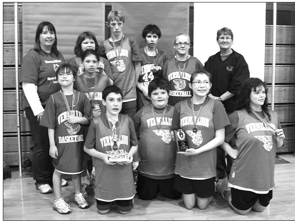
Pictured are members of the Vermillion Special Olympics basketball team. These athletes brought home the silver medal after competing in the state Special Olympics tournament in Mitchell.