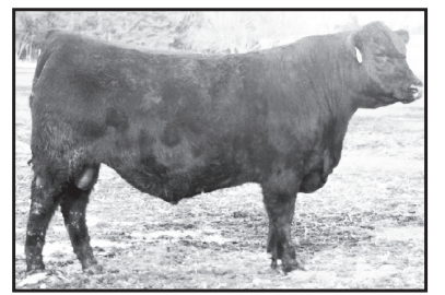
He Sells! Lot 45. Sire Connealy Calvry. BW 84 lbs.; WW 775 lbs.; Adg. 4.9 lbs.; YW wt. 1,560 lbs. EPD's: BW+3.2; WW+78; M +30; YW+ 131