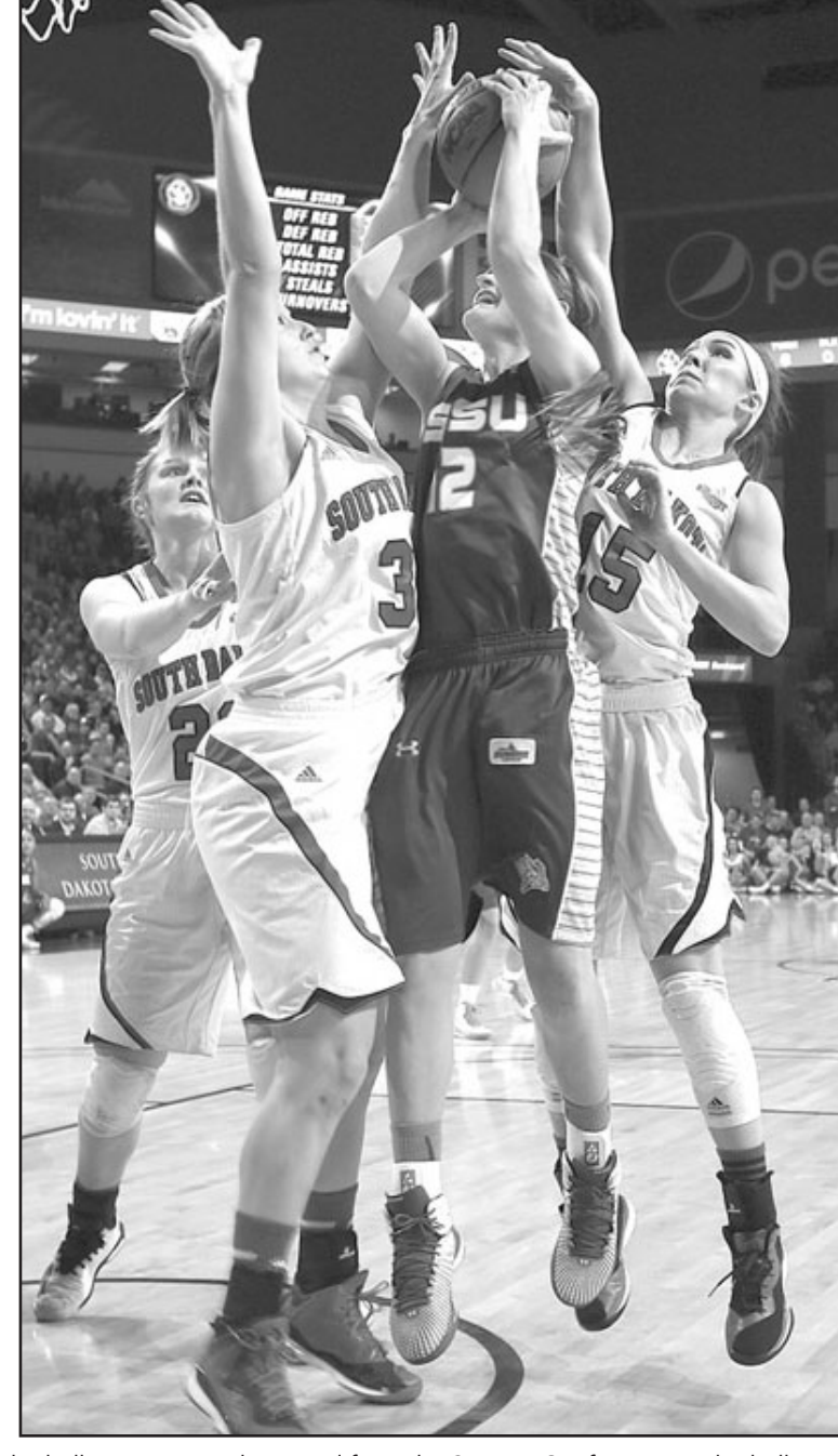
University of South Dakota's men's (left in red) and women's (right, in white) basketball teams were eliminated from the Summit Conference Basketball Tournament earlier this week. The men fell in the semifinals and the women in the final, both to archrivals South Dakota State. The teams won't know if they will play in a postseason tournament until Sunday or Monday.