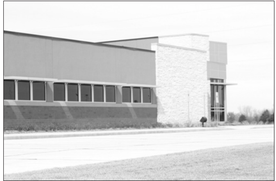
This building, located at 1012 Princeton Street in Vermillion, was originally set to be the home of Eagle Creek Software Services Inc. Alas, things changed and it is now known as the Vermillion Technology Center.