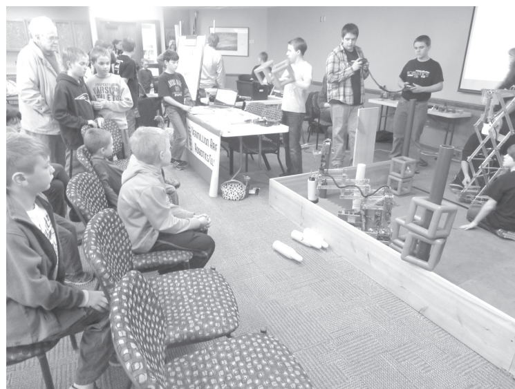
Members of the Vermillion Area Robotics Club showcased their winning robots to delighted spectators young and old at the library Monday evening giving them the chance to test drive one of them.