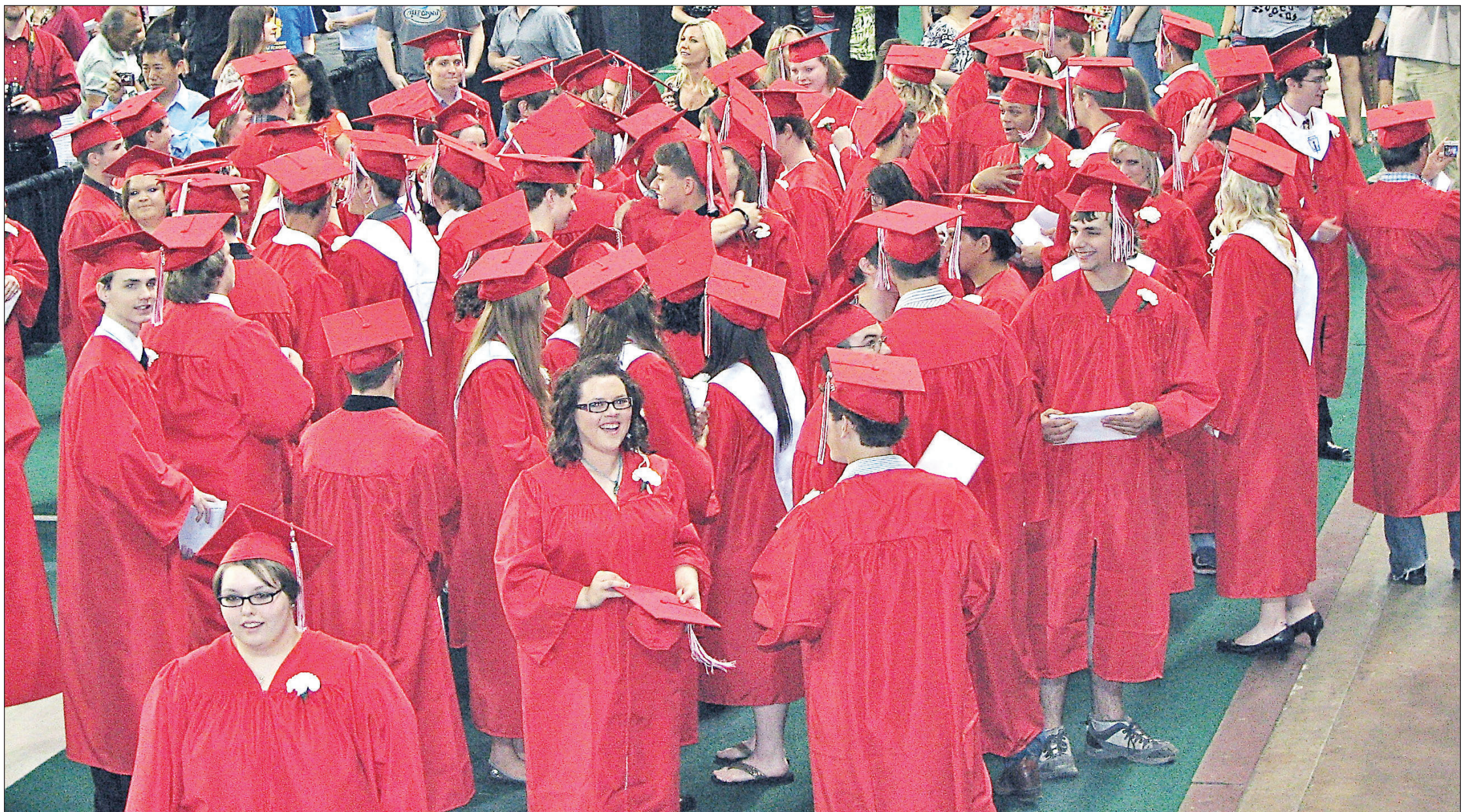
The Vermillion High School class of 2012 mingles on the floor of the DakotaDome following their graduation ceremony Saturday afternoon.