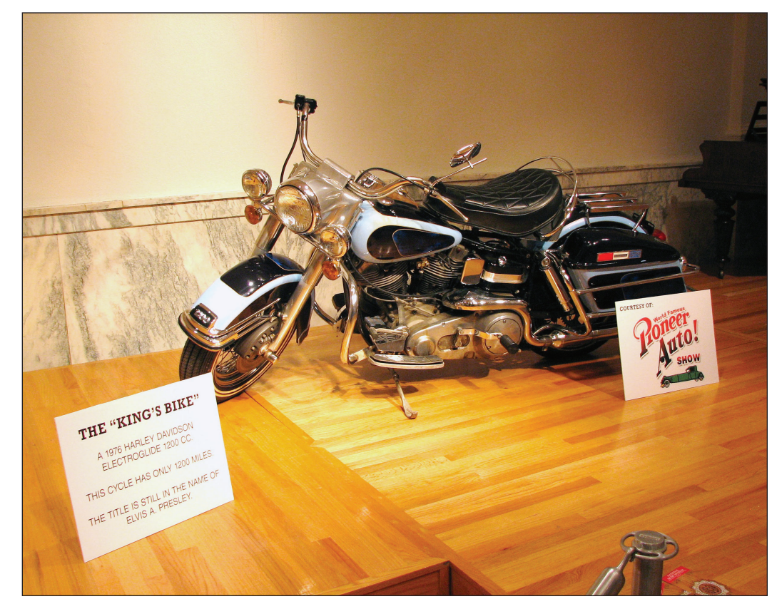
This 1976 Harley Davidson Electra Glide 1200 CC motorcycle was on display courtesy of the Pioneer Auto Show of Murdo Friday at the National Music Museum to help unveil the new "celebrity collec-