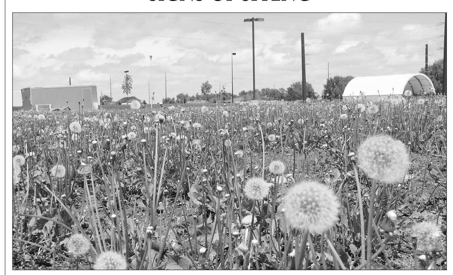
Lots filled with dandelions have become a common sight in Vermillion over the past few weeks, following a period of increased rain and warmer temperatures. In some spots, such as this one near Wal-Mart, it can be difficult to determine where the dandelions begin and the grass ends.