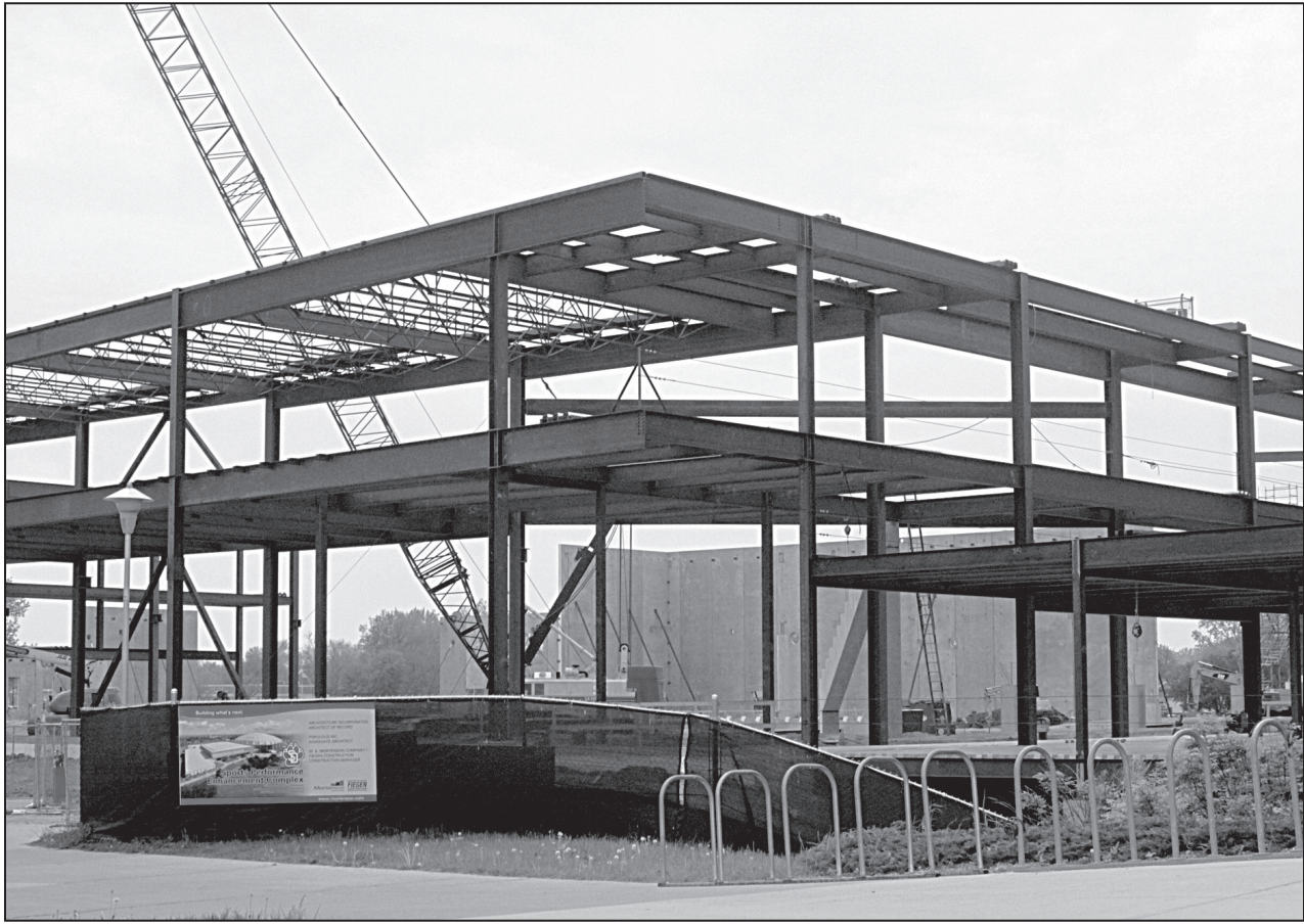
BY ELYSE BRIGHTMAN/ FOR THE PLAIN TALK

The construction of The University of South Dakota's new basketball and volleyball arena is right on schedule, according to USD's building engineer Lorin Wilcox. Currently, the steel structures are being erected and most of the exterior walls are up, with the exception of the far west side. For the soccer and track complex, the bleacher systems have been installed and the earth work is complete for the track surface to be installed during the summer.